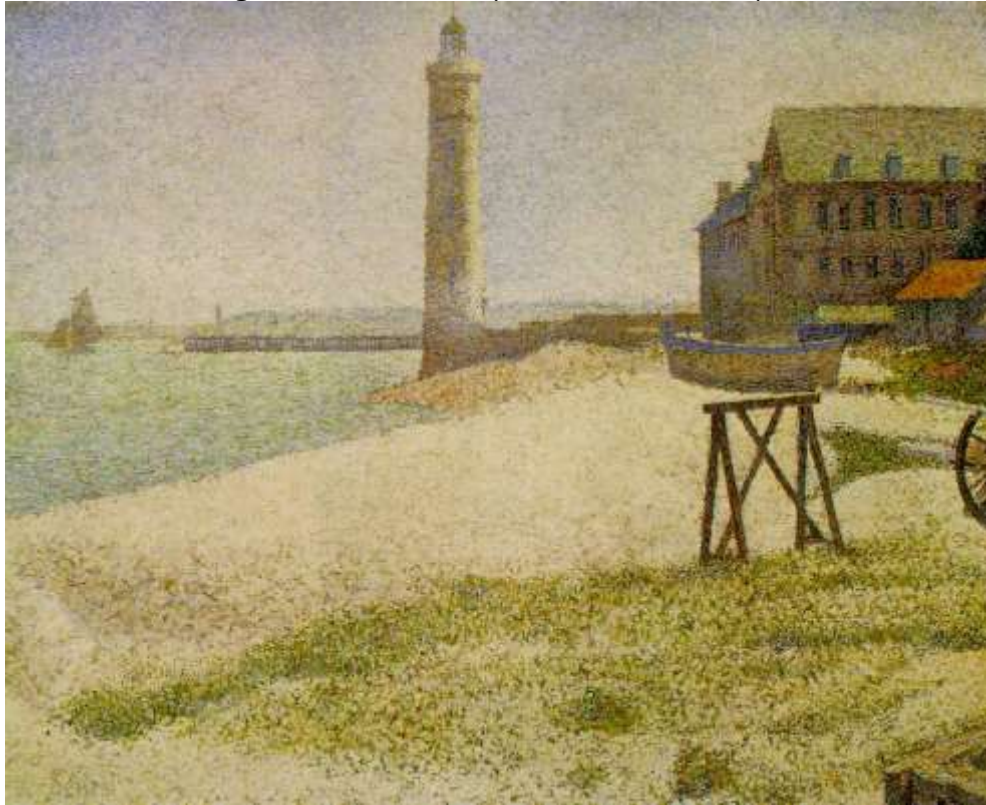
Georges, Seurat The Lighthouse at Honfleur 1886; Oil on canvas, 66.7 x 81.9 cm

Look at the image below and complete a visual analysis on it: